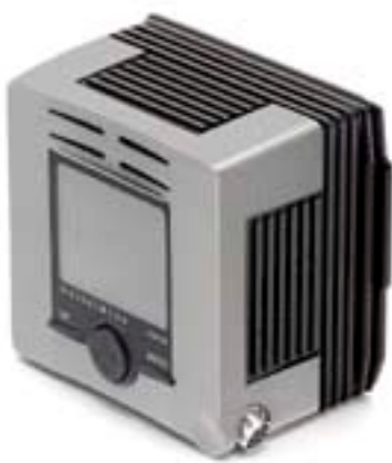
HASSELBLAD IXPRESS 96C with 16 Mpixel sensor and i-Adapter