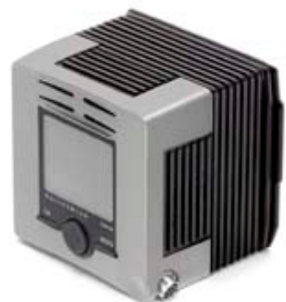
HASSELBLAD IXPRESS 528C with 22 Mpixel sensor, multi-shot and i-Adapter