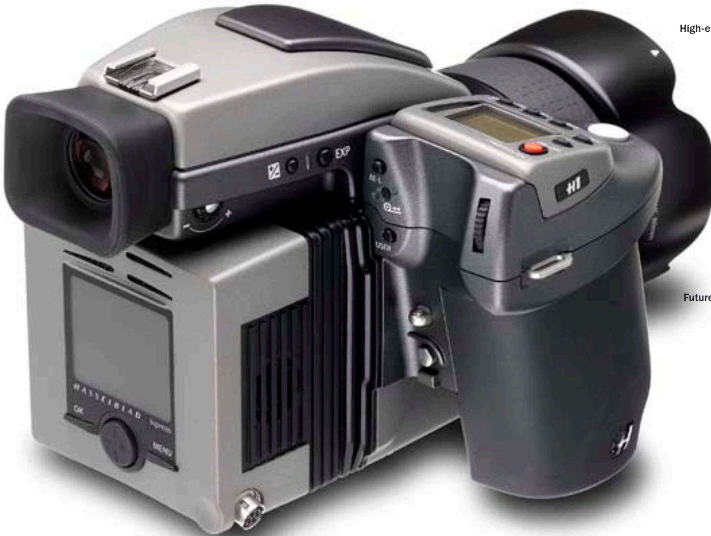
Photo above includes: H1 camera body, viewfinder, HC 80 mm lens, Hasselblad Ixpress 132C digital back, including i-Adapter.